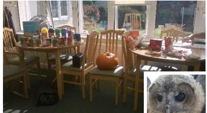
Harvest 2015 and Soft landings at St Elmo 2016