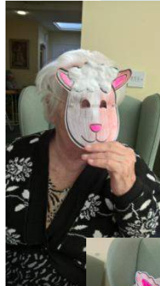
Residents having some winter fun

Namaste is a way of stimulating the senses, by use of sound, touch and smell and the residents chosen for this have little or no communication skills. That however has now begun to change.